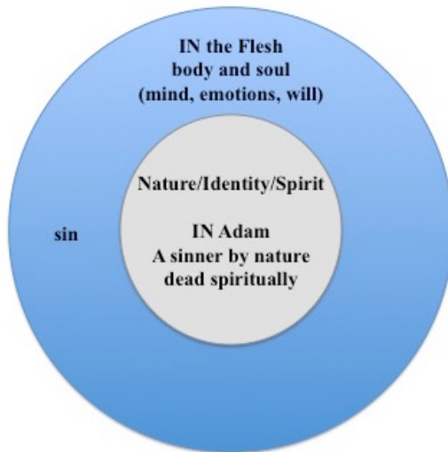
In Adam and In the Flesh

Who Has God Made You Now that You've Become a Christian? 2 Cor. 5:17